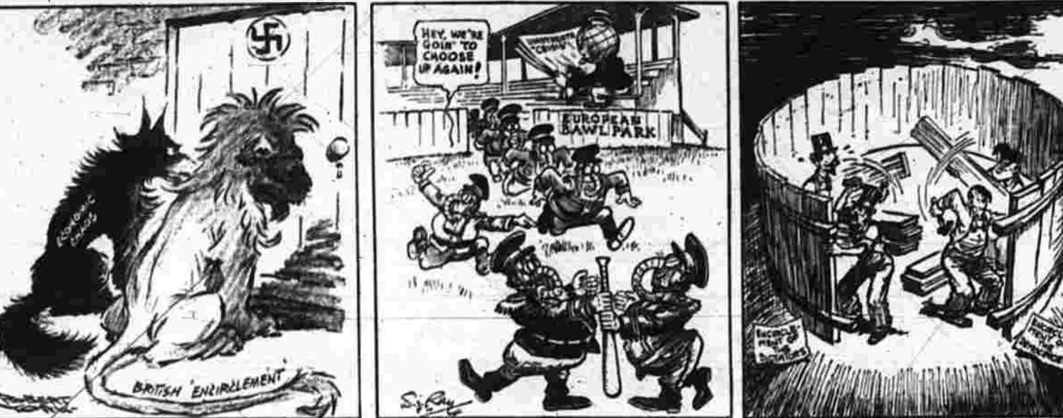
The Wolf at Hitler's Door Has Company... They May Call It On Account of Darkness... Just Another Approaching Crisis

This Spring in Europe—As Depicted by American Cartoonists