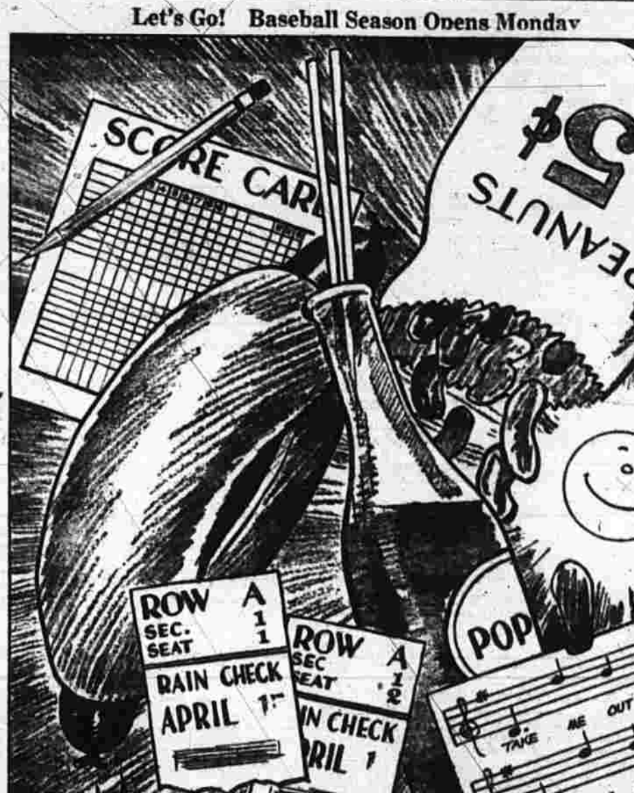
Let's Go! Baseball Season Opens Monday

Chicago, April 15.—(AP)—The Catholic Men's Club will enjoy a sports night Friday.